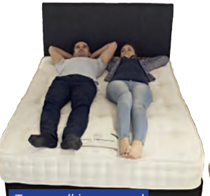
Too small is no good

Also consider the bed's height – many contemporary styles are low, while those with storage drawers may be much higher.